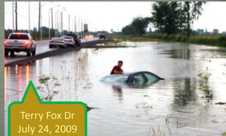
Terry Fox Dr July 24, 2009